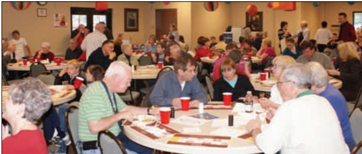
A room full of people eating fish, socializing and having fun!