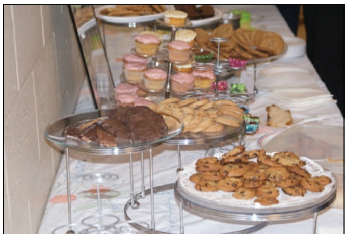
Some of the delicious homemade desserts courtesy of the women's council.