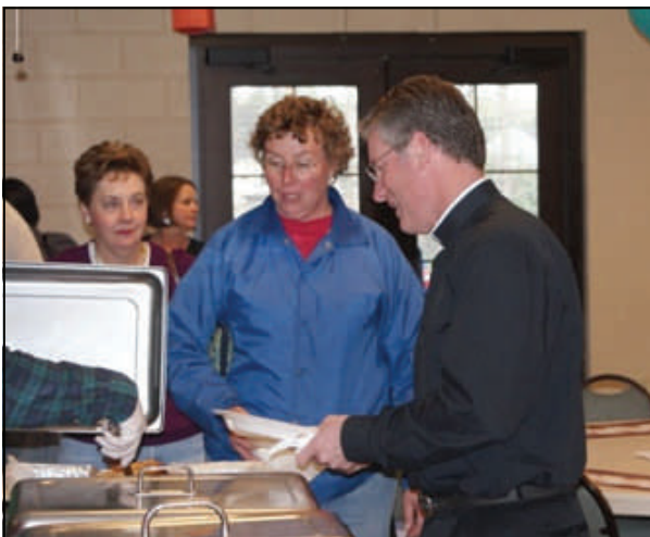
We all wait our turn for the tasty fish and fixings!